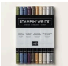
Neutrals Stampin' Write Markers [161697] $62.50