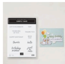
Simply Said Mix & Match Photopolymer Stamp Set (English) [163756] $30.00