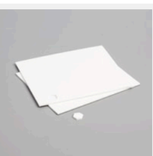
Stampin' Dimensionals [104430] $7.50