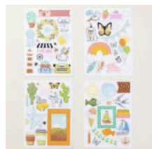
Something For Everything Mix & Match Ephemera Pack [163763] $14.00