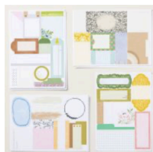
Labels & Layers Mix & Match Ephemera Pack [163764] $14.00