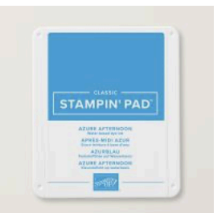
Azure Afternoon Classic Stampin' Pad [161663] $15.75