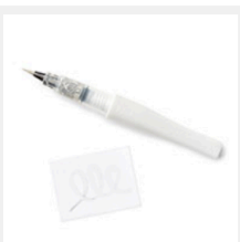
Clear Wink Of Stella Glitter Brush [141897] $15.75