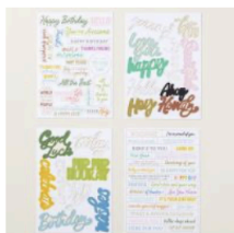
Saying Something Mix & Match Ephemera Pack (English) [163761] $14.00

all supplies can be purchased in my online store find at www.kaylarenee.com