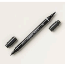
Basic Black Stampin' Write Marker [162481] $6.25