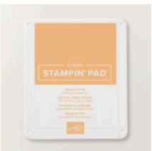
Peach Pie Classic Stampin' Pad [163810] $15.75