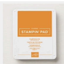
Pumpkin Pie Classic Stampin' Pad [147086] $15.75