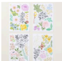
Fully Flowering Mix & Match Ephemera Pack [163762] $14.00