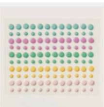
2024 2026 In Color™ Resin Dots [163389] $14.00