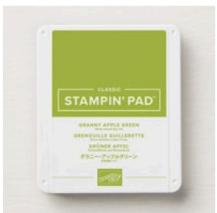
Granny Apple Green Stampin' Pad [147095] $15.75