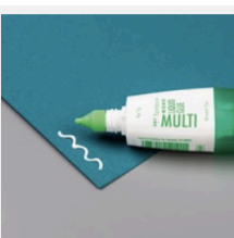
Multipurpose Liquid Glue [110755] $10.50