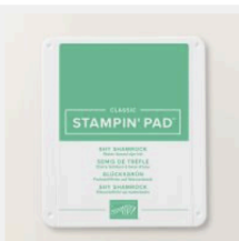
Shy Shamrock Classic Stampin' Pad [163808] $15.75