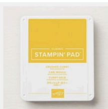
Crushed Curry Classic Stampin' Pad [147087] $15.75