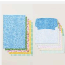
Sunny Springs Mix & Match Cards & Envelopes [163754] $14.00