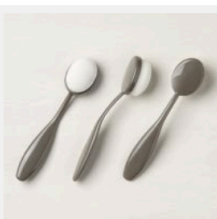
Blending Brushes [153611] $27.00