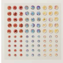
Iridescent Pastel Gems [160429] $14.00