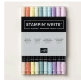
Subtles Stampin' Write Markers [161698] $62.50