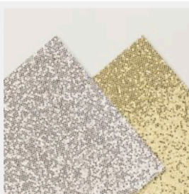
More Dazzle 6" X 6" (15.2 X 15.2 Cm) Specialty Paper [161749] $13.25