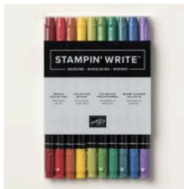
Regals Stampin' Write Markers [161699] $62.50