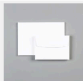
Basic White Note Cards & Envelopes [159232] $14.00