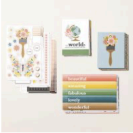
Sweet Thoughts Memories & More Card Pack [162930] $17.50

all supplies can be purchased in my online store find at www.kaylarenee.com