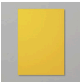
Card Stock A4 Crushed Curry [131288] $17.50