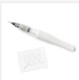
Clear Wink Of Stella Glitter Brush [141897] $14.00