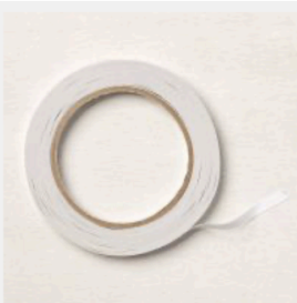
Tear & Tape Adhesive [154031] $12.25