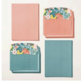
Sweet Thoughts Memories & More Cards & Envelopes [162931] $17.50