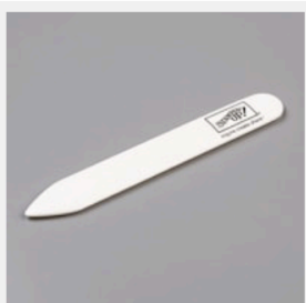
Bone Folder [102300] $12.25