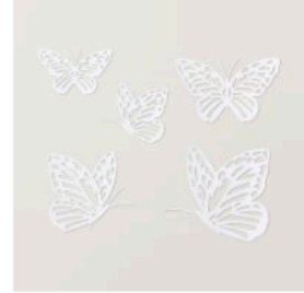
Paper Butterfly Accents [162612] $14.00