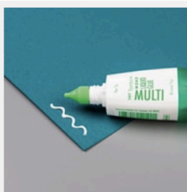
Multipurpose Liquid Glue [110755] $9.75