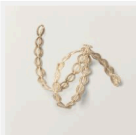
Natural 1/4" (6.4 Mm) Wavy Trim [161517] $12.25